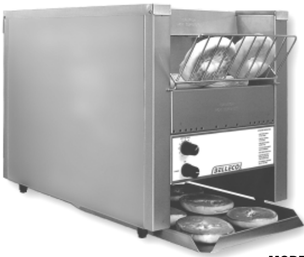
MODEL JT2-B SHOWN