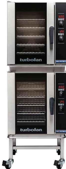
Model E33D5/2C shown