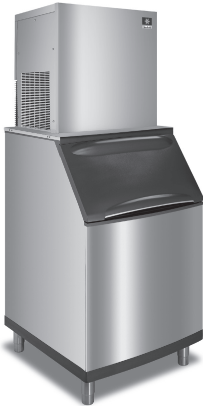
RFS-1279R Low-Side/Rack Flake Ice Machine on B-570 Bin