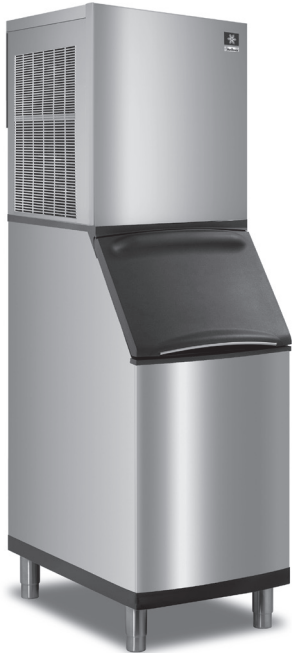
Model RFS-0300A Flake Ice Machine on B-420 Bin