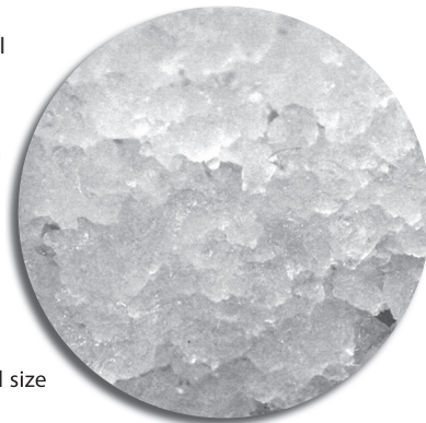
Ice shown actual size

Flake ice is small hard bits of ice ideally suited for presentation applications.