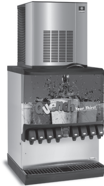
RN-0408A Nugget Ice Machine on Servend SV-250 Dispenser