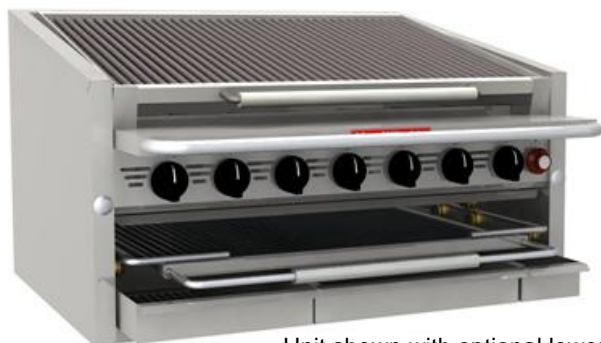
Unit shown with optional lower rack