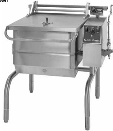
Model BPP-30G shown

A heavy-gauge fully adjustable one-piece cover is standard with torsion bar type counterbalance designed to maintain the selected cover position. A vent is provided in the cover top to regulate condensate buildup and a rear condensate drip shield is located under the cover to prevent condensate from dripping on floor when cover is opened.