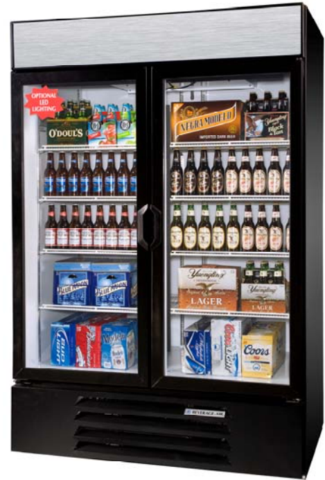
LV49-1-B (shown with 4 shelves per section)