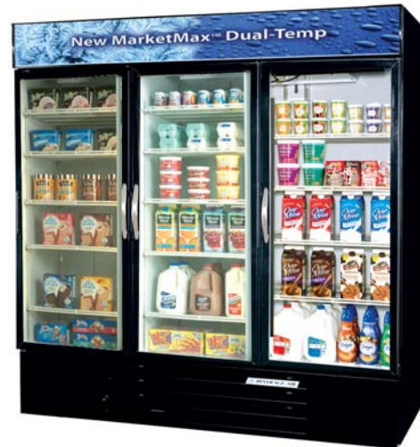
MMRF72-1-B (SHOWN IN BLACK EXTERIOR) White and S/S Exterior finishes available

MODELS: MMRF72-1-B MMRF72-1-W MMRF72-1-B-LED MMRF72-1-W-LED